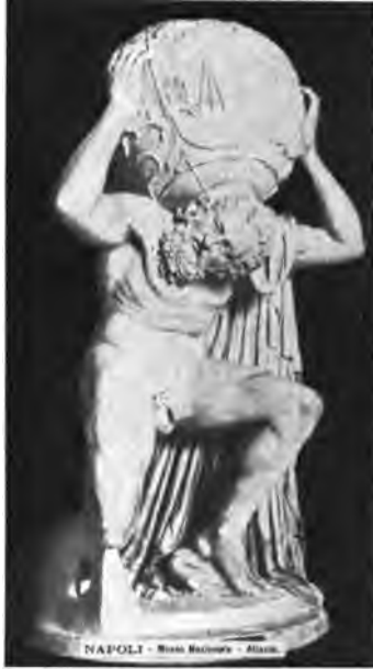
Fig. 63. Atlas supporting the Heavens.

anger had sent a terrible sea-monster to devastate the coast, and the oracle had pronounced that only by the sacrifice of the princess An drom'e da could the land be freed from this terror. So, when Perseus came flying by on his winged san-